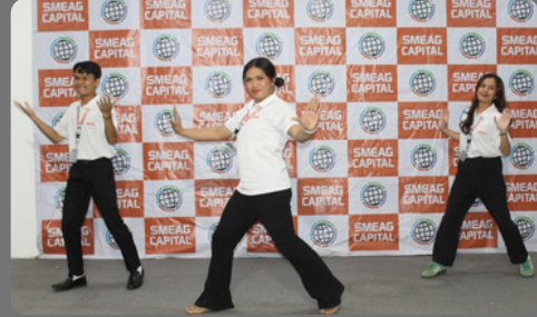
Energy in motion: Students take the stage to perform an upbeat dance routine, reflecting the high spirits, confidence, and vibrant energy of the SMEAG community during the event.