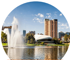
DISCOVER ILSC ADELAIDE