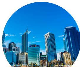
DISCOVER ILSC PERTH