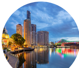
DISCOVER ILSC BRISBANE