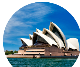
DISCOVER ILSC SYDNEY