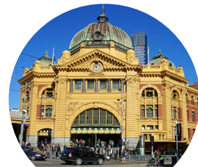
DISCOVER ILSC MELBOURNE